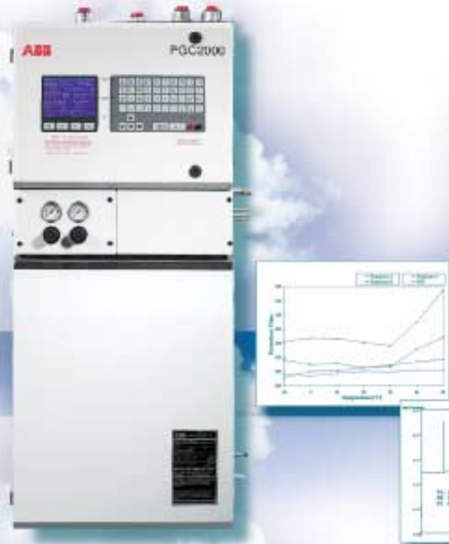
Process Gas Chromatograph

The PGC2000 uses an integrated backplane that eliminates wiring harnesses and terminal strips. All subsystems such as temperature controllers, detector amplifiers, sensors, and options are assigned specific, clearly labeled plug locations. This self-documenting concept greatly improves serviceability and upgrade ability. It also improves quality and reliability by eliminating loose wiring connections and allowing components and modules to be tested before system installation.